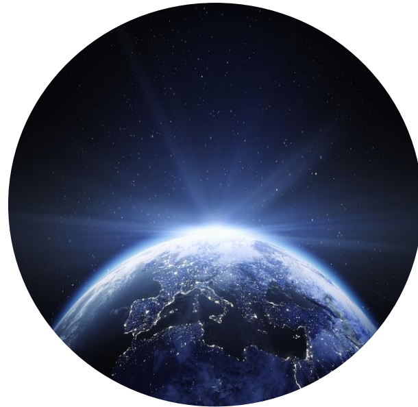
Connectivity in Europe and Latin America