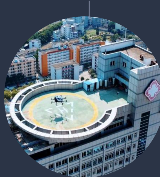
MEDICAL DELIVERY SERVICES