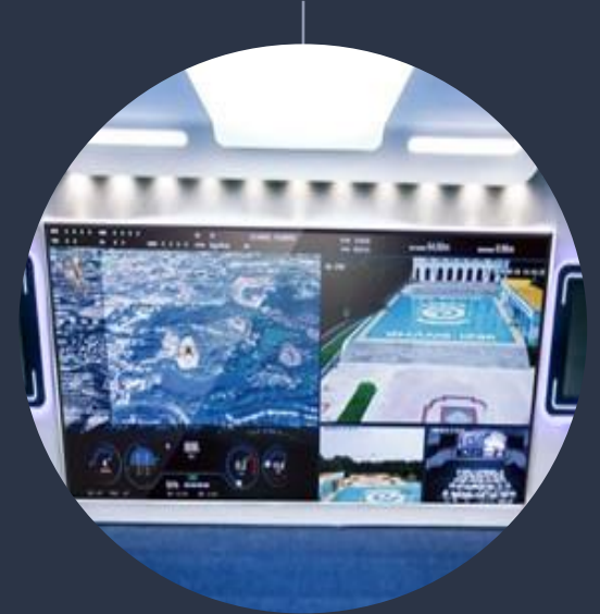
SMART CITIES MANAGEMENT