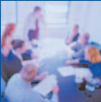
[ Members of the Board ]