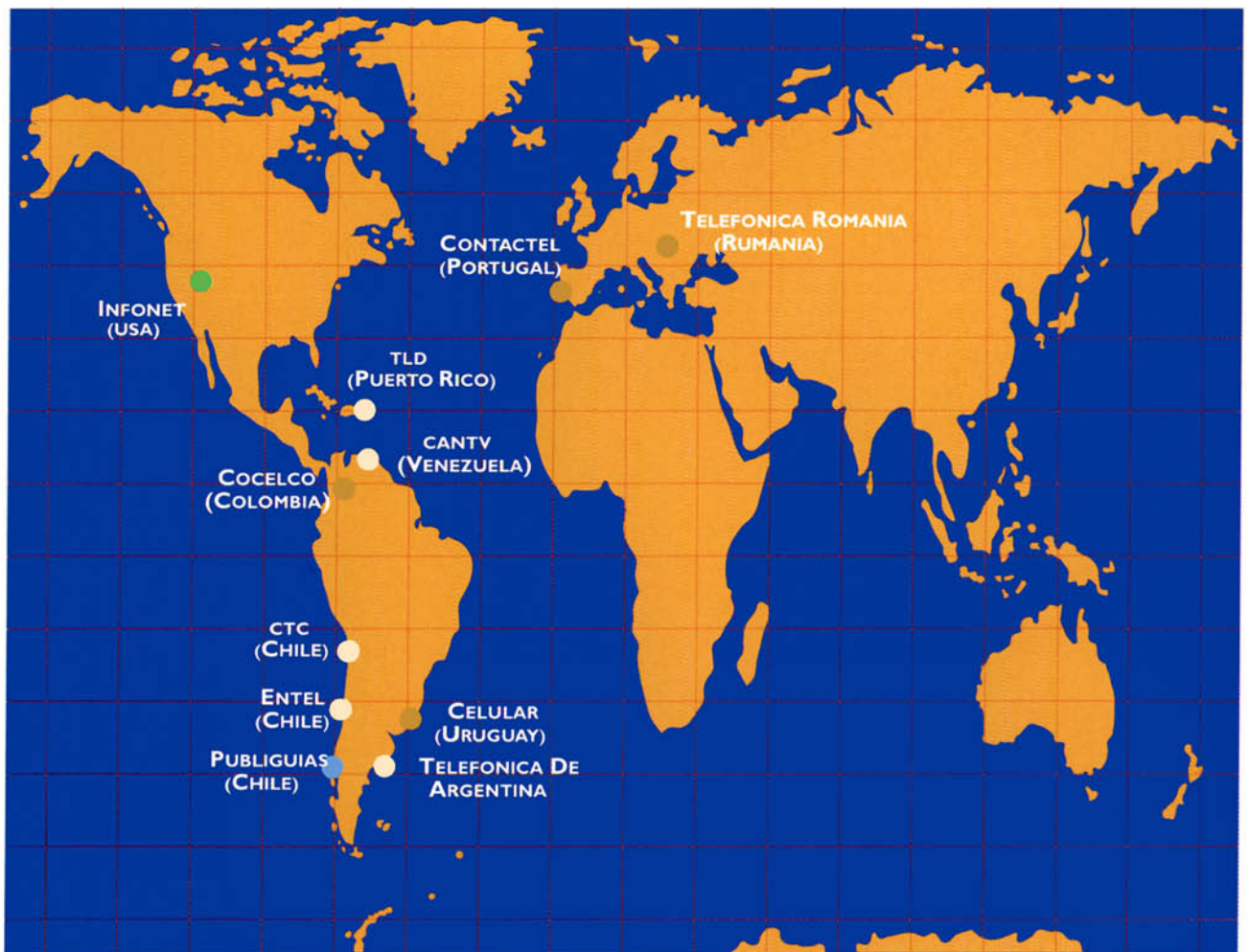
● TELEPHONE OPERATORS ● MOBILE ● DATA TRANSMISSION ● DIRECTORIES