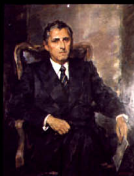
D. Antonio Barrera de Irimo 1965 - 1973