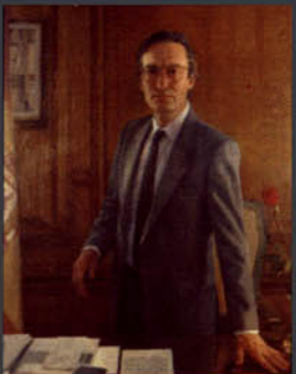
D. Luis Solana Madariaga 1982 - 1989

In 1955 the number of telephones installed by Telefónica reached the million mark. At that time there were only 11 countries in the world which exceeded this figure. In 1957 the Madrid-Zaragoza-Barcelona coaxial cable entered into service with 432 telephone circuits. In 1962 the two millionth telephone was installed and the third four years later in 1966. 1969 was another important landmark in the history of Spanish telecommunications: thanks to the 10 million kilometres of circuits installed, half of the trunk calls could be selected automatically. In addition, in 1965, integral automatization of Spain's network commenced, with trunk communications between Madrid, Zaragoza and Barcelona.