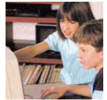
Educared.net, is a Telefónica Foundation programme directed at primary and secondary education, promoting the educational use of Internet

2002 the digital home display was inaugurated in the centre of Madrid, emphasizing the benefits derived from the use of ADSL in homes. Also in 2002, effective deployment of information services over GPRS was carried out. Within the most advanced multimedia mobile services, work was undertaken to anticipate services based on UMTS possibilities.