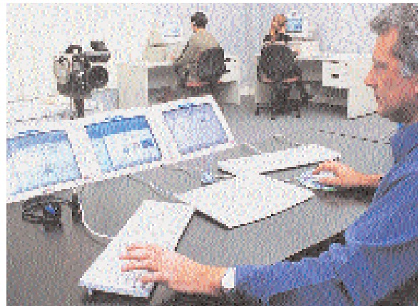
Telefónica Data España has cooperated with First Data Ibérica in launching a payment system for taxicabs