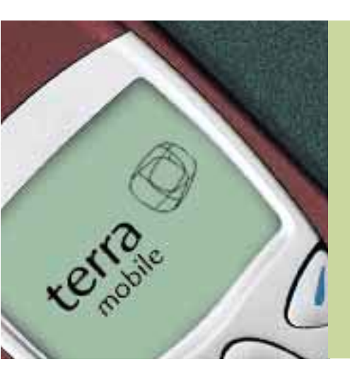
The Terra Mobile portal offers an enormous choice of mobile electronic commerce (mcommerce), business, e-mail, games, fax, information and other services